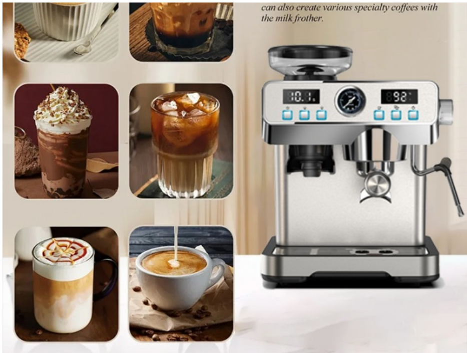
can also create various specialty coffees with the milk frother.