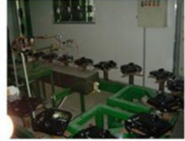
Coating - 2