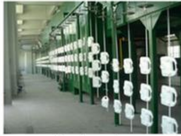
Coating - 1