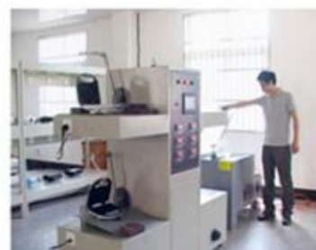
Test - 2