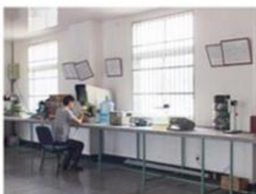
Test - 1