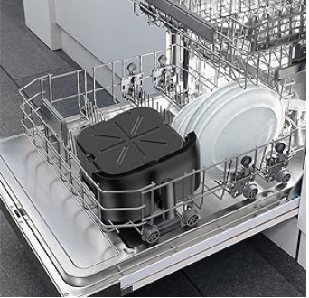
Less Oil - More Healthier

This Air fryer cooks by 360° circulating hot air, offer you crunchy food with little to no oil. Frying basket and pan combo separates food in the basket from fat and oil dripping down the pan. Say goodbye to traditional deep frying! You can say goodbye to deep frying.