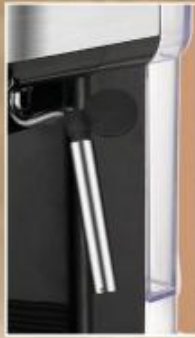
Stainless steel steam wand