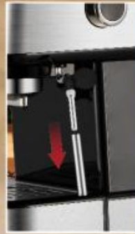
Removable Tube for Easy Clean

Steam Wand Makes Perfectly Texturized Microfoam