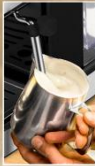
Turn Milk into a Silky Smooth Foam