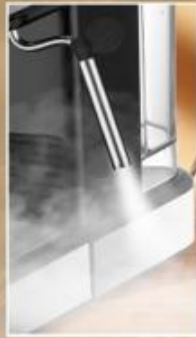
Heat Up 25 Seconds