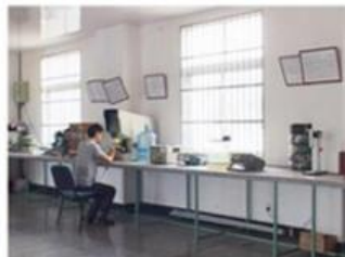
Test - 1