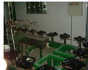
Coating - 2