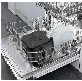
Less Oil - More Healthier

This Air fryer cooks by 360°circulating hot air, offer you crunchy food with little to no oil. Frying basket and pan combo separates food in the basket from fat and oil dripping down the pan. Say goodbye to traditional deep frying! You can say goodbye to deep frying.