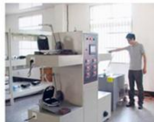
Test - 2