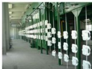
Coating - 1