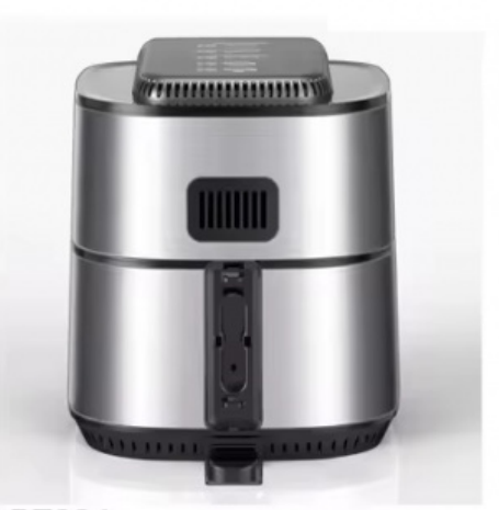
Full SS housing BF886