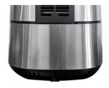
Full SS housing BF501C