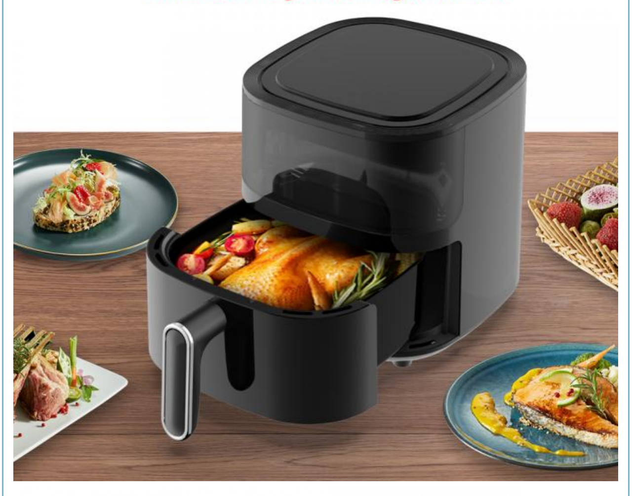
Stainless steel smart design models (5.5L/6.5L big size)

Automatic Power off When Taking out the Basket Continue Running After Putting Basket Back