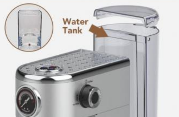
Removable Transparent Water Tank (1100 ML)