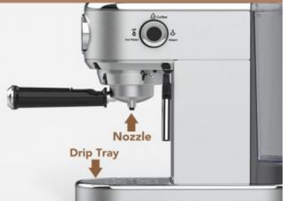
Detachable Frothing Nozzle & Drip Tray (easy to clean)