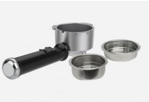
2-IN-1 Filter Holder (1 or 2 cups or ese pods)