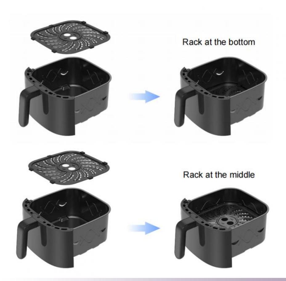
big size air fryer oven