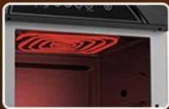
Top square heating element