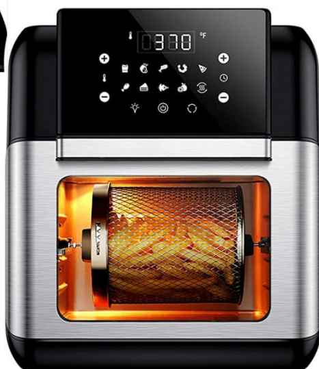
wifi air fryer oven