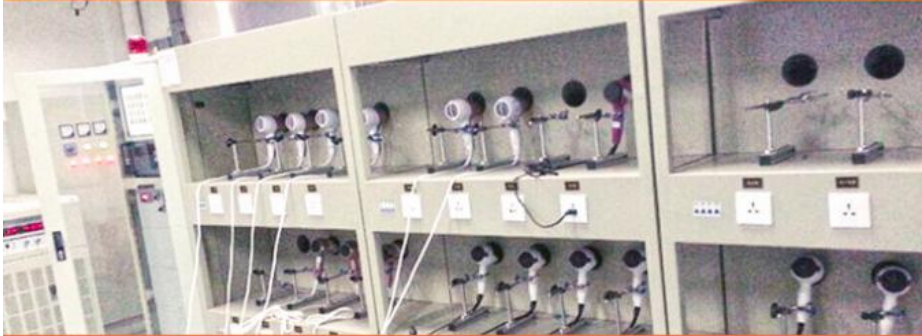
Accurate Temperature Test & Ceramic Coating Plates Test