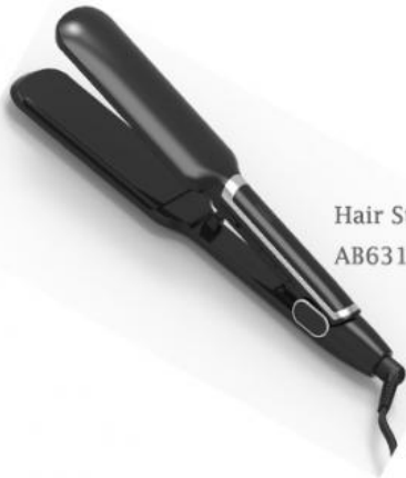
Hair Straightener AB631