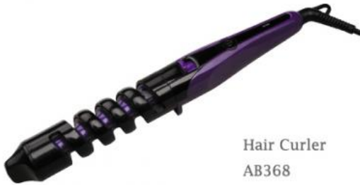
Hair Curler AB368