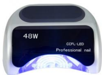
Nail Dryer UV lamp AU05