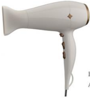
Hair Dryer AD10