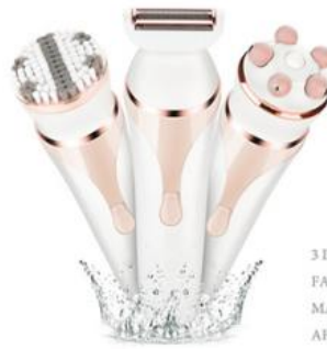
3 IN 1 SHAVER FACIAL BRUSH MASSAGER AF1011