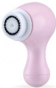
FACIAL BRUSH AF736