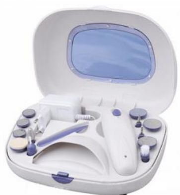
Nail Set AF130