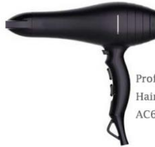
Professional Hair Dryer AC64