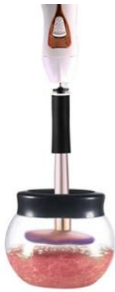
MAKEUP BRUSH CLEANER AF1222