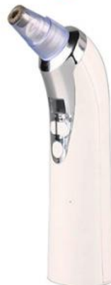
BLACKHEAD REMOVER AF633