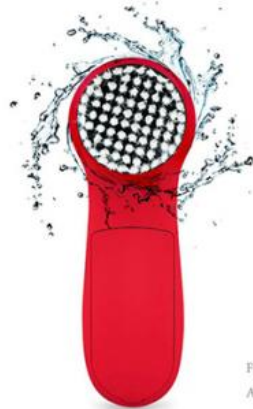
FACIAL BRUSH AF300