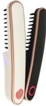
Hair Straightener AB290