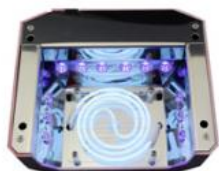
Nail Dryer UV lamp AU18