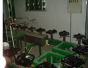
Coating - 2