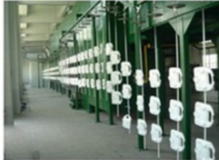
Coating - 1