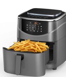
7L Steam air fryer