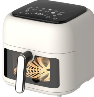
6.5L Digital air fryer