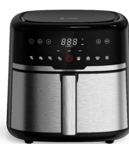
4/6/8L wifi air fryer