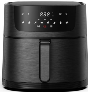
4/6/8L air fryer