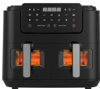
Double air fryer with visible window