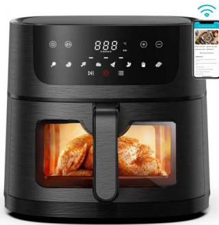
Visible air fryer