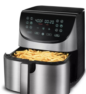
6.5L Digital air fryer