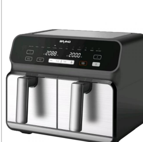
Double air fryer S/S cover