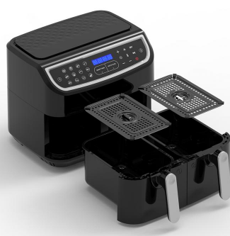
Double air fryer