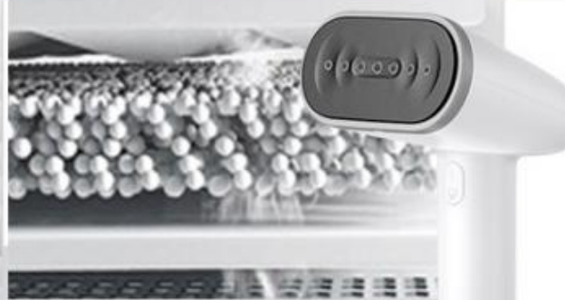
Super Penetrating Power